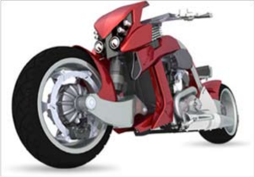
The V-Rex from Travertson, Inc. is a perfect example of what the combination of SolidWorks and NVIDIA Quadro can deliver to leading designers and engineers. Image courtesy of Travertson Motorcycles.

The latest Quadro professional graphics solutions support and enhance SolidWorks RealView in ways other cards can't. With RealView, your 3D models come to life and interact with their environments. And with NVIDIA Quadro under the hood they will do it in real time.